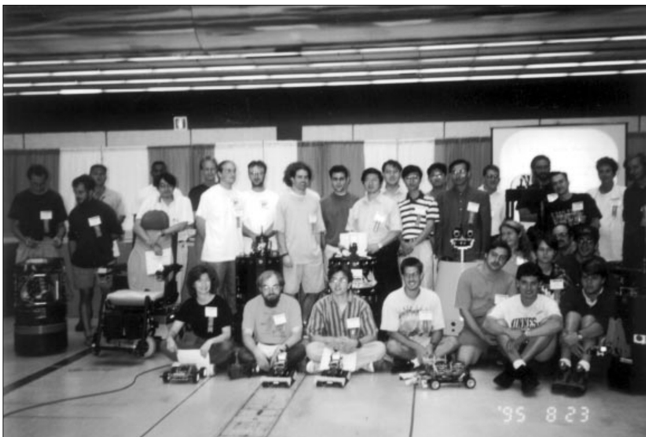
The 1996 Robot Teams.

humans over the course of this experiment, the researchers were extremely pleased with the results.