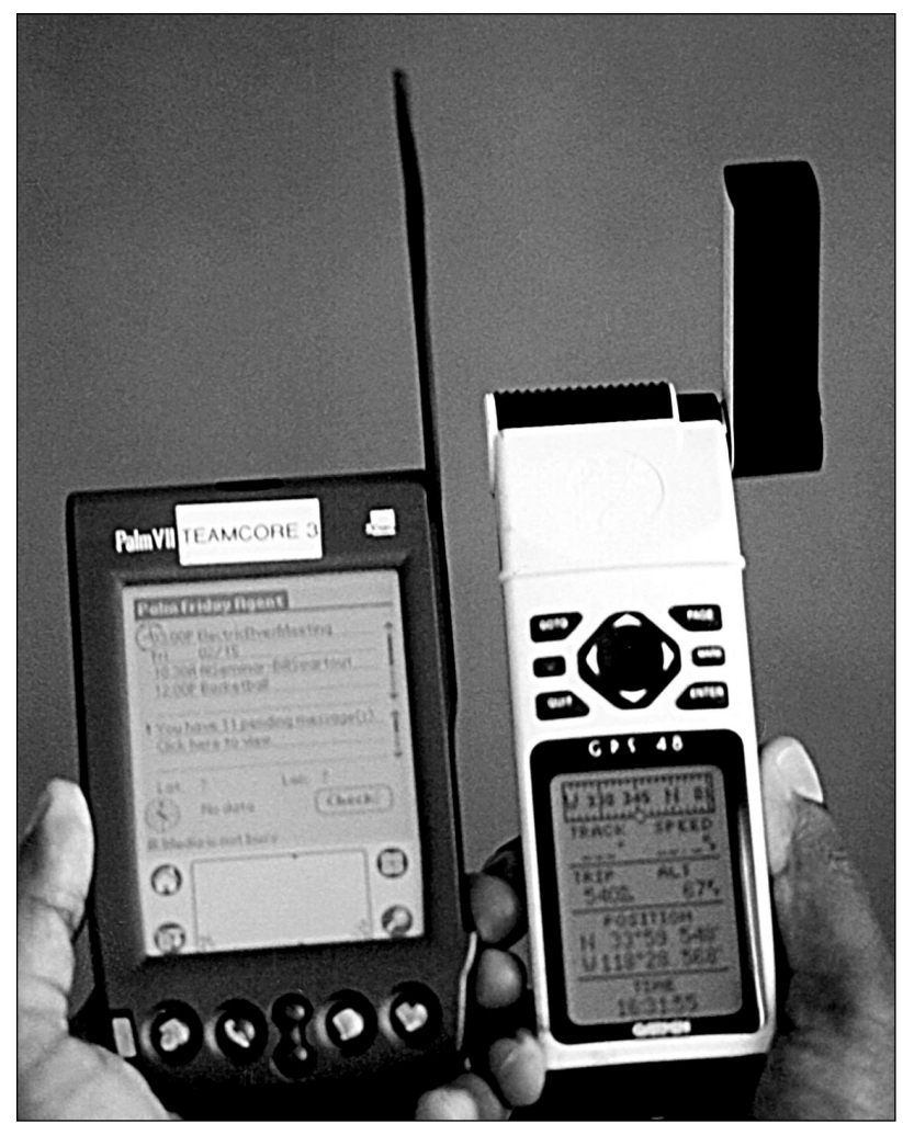
Figure 1. A Palm VII Personal Digital Assistant with Global Positioning System Receiver.

agents, including 9 proxies for 9 people plus 2 different matchmakers, 1 flight tracker, and 1 scheduler running continuously for the past several months. This article discusses the tasks performed by the system, the research challenges it faced, and its use of AI technology in overcoming these challenges.