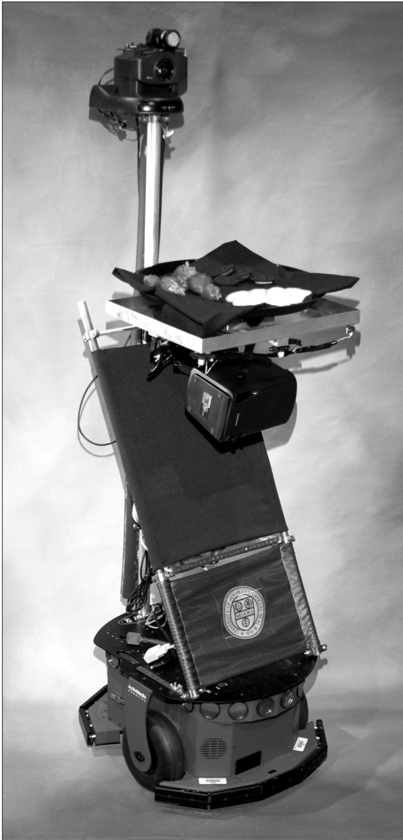
Figure 3. MABEL, the Mobile Table from the University of Rochester.

in unanticipated ways (such as clustering around, asking questions, or purposefully foiling the robot's attempts to move). This situation also makes navigation more difficult for the robots. Also, being in such noisy environmental conditions, it was hard for the teams to demonstrate vocal interactions with people. However, because the robots still have some limitations to overcome before becoming real servants, vocalization helps people focus on what the robots are trying to do as part of the interaction. Such problems have to be taken into consideration when we move robots out of the controlled conditions of research labs. The Robot Host event is a great opportunity to experiment in such a context. The event also serves as a common evaluation test bed for the different approaches used to implement the intelligent decision-making processes required by the autonomous robot servants.