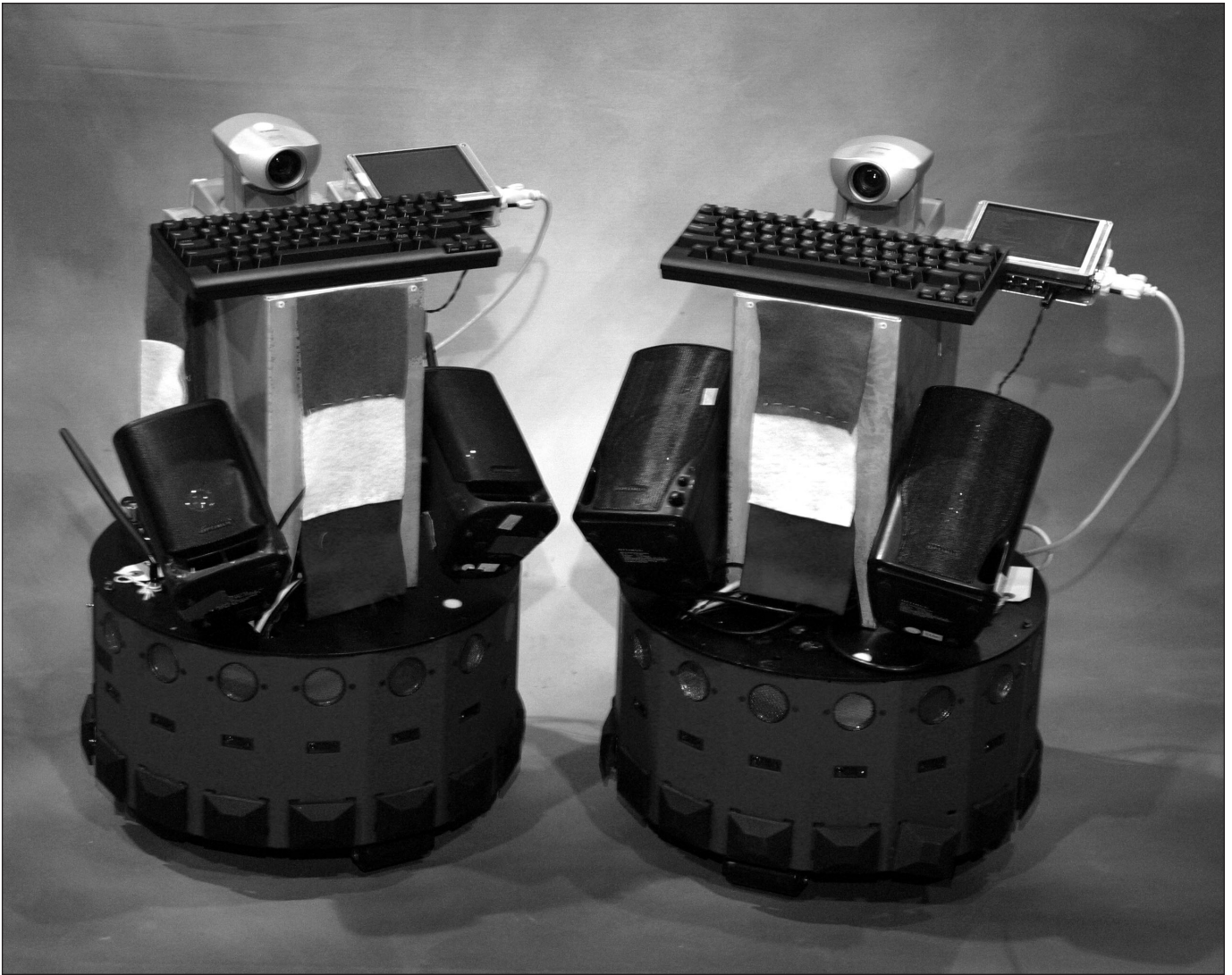
Figure 2. FRODO and ROSE.

face; the robots could use the shirt information in conversation with conference participants.