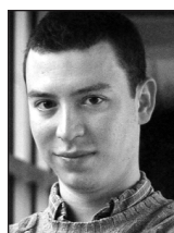
Luis von Ahn Carnegie Mellon University